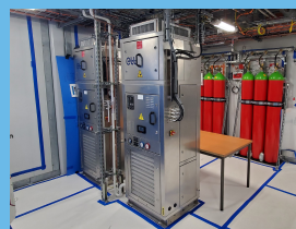
ACU in Aluminium AG3