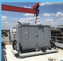
ACCU in SS 316 L *