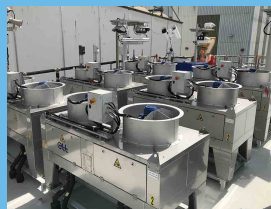
ACC in SS 316 L *