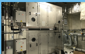
Air Handling Unit for Pressurization