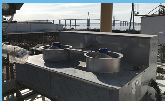
ACC in SS 316 L *